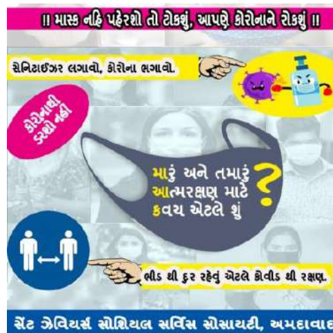
સેટ ઝેવિયર્સ સોશિયલ સર્વિસ સોસાયટી, અમદાવાદ