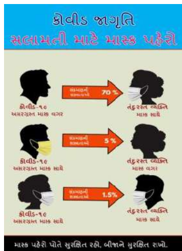
સેટ ઝેવિયર્સ સોશિયલ સર્વિસ સોસાયટી, અમદાવાદ