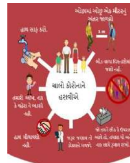
સેટ ઝેવિયર્સ સોશિયલ સર્વિસ સોસાયટી, અમદાવાદ