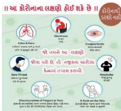
સેટ ઝેવિયર્સ સોશિયલ સર્વિસ સોસાયટી, અમદાવાદ

genuineness and fakeness, to make the awareness posters, leaflets and banners to give correct information and awareness on social responsibility, to take precautions to control the rapid spread of COVID -19. The people had a lot of fear and misconceptions like the vaccine will lead to infertility, untimely deaths, inserting a chip to manipulate future life thus there was a lot of unwillingness and hesitancy amongst the masses to take the vaccine jabs. Thus, the awareness materials were prepared and posted in social media like WhatsApp groups, face book, twitter and Instagram. Leaflets and posters were distributed and were placed in the slums. As a result, the fear of vaccine gradually got reduced and many came forward to take vaccination.